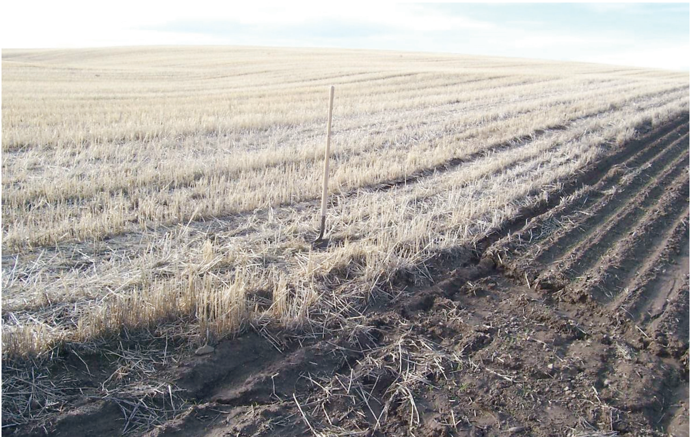
Figure 3. Winter erosion after winter wheat harvest, direct seed versus conventional tillage.