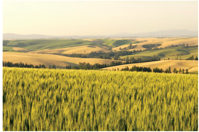
Figure 2. The Palouse region.

Nonetheless, the expected increase in precipitation over the next several decades could lead to increases in prevented planting claims and erosion rates similar to 2011. During that year, erosion rates were estimated to be as much as 50 tons per acre on some fields. According to the USDA, each ton of soil eroded in the Pacific farm production region has a negative economic impact of $0.53. Combating soil erosion from weather events will help ensure long-term productivity and profitability. One way to do this would be to plant cover crops on prevented planting acreage, which would reduce erosion and increase soil quality on land that lies fallow.