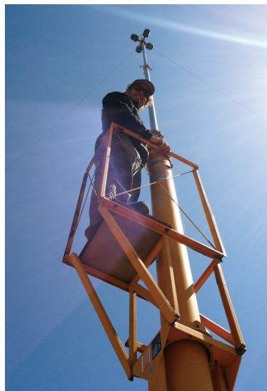
Figure 1. Troy Magney, raising the pneumatic pressure tower to 75 feet at the Washington State University Cook Agronomy Farm. The tower was gifted to the lab by NASA more than a decade ago.

To quantify the amount of light energy that is reaching the camera for a given pixel in the image, we used a user-friendly software package called “ImageJ,” which can be downloaded