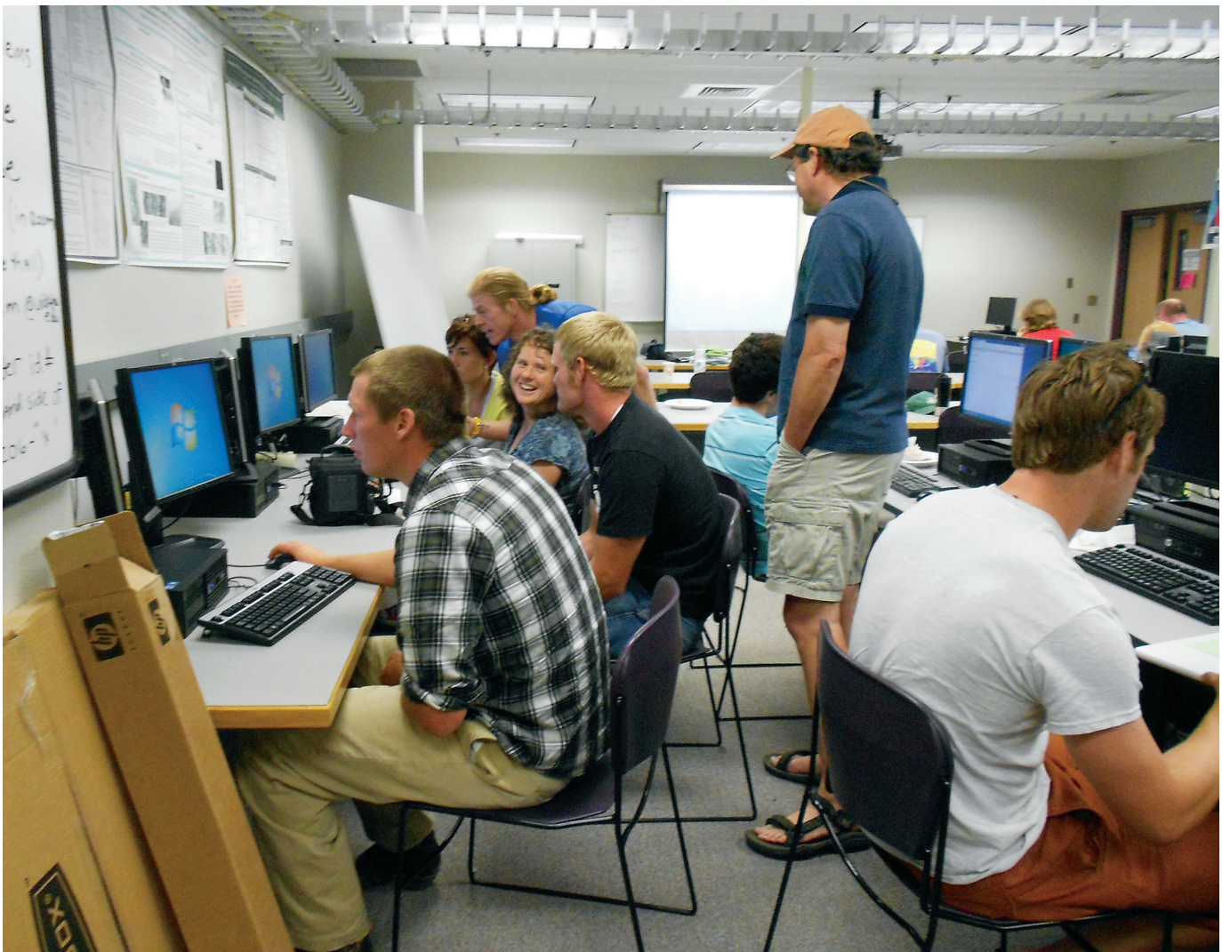
Figure 3. REACCH students participating in a data management course in August 2013.