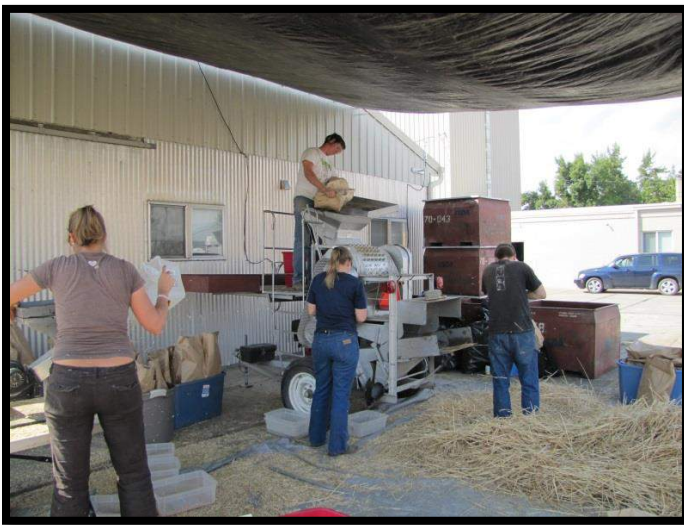
Figure 1. REACCH graduate students using a stationary thresher to separate grain from straw in Pullman, WA.

To determine HI, researchers cut 3 meter rows of crop per plot, just before harvest. The three samples are collected randomly to ensure a representative sample. This entire sub-sample is then weighed, threshed (Figure 1), and the remaining grain is weighed a second time.