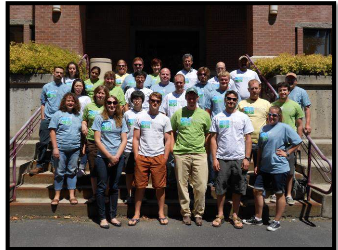
2013 REACCH Summer Graduate Student Retreat Participants