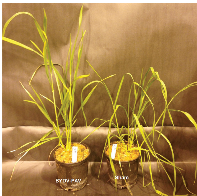
Figure 2. Triticum aestivum cultivar 'JD' following a challenge with seven days of water scarcity. Infected plants were visibly more turgid and robust at the end of the experimental period.

When water inputs were low, infected plants retained more water (Figure 2). Before we imposed water scarcity, host infection status had no effect on leaf water potential, but following a seven-day period of water scarcity, BYDV-PAV-infected plants