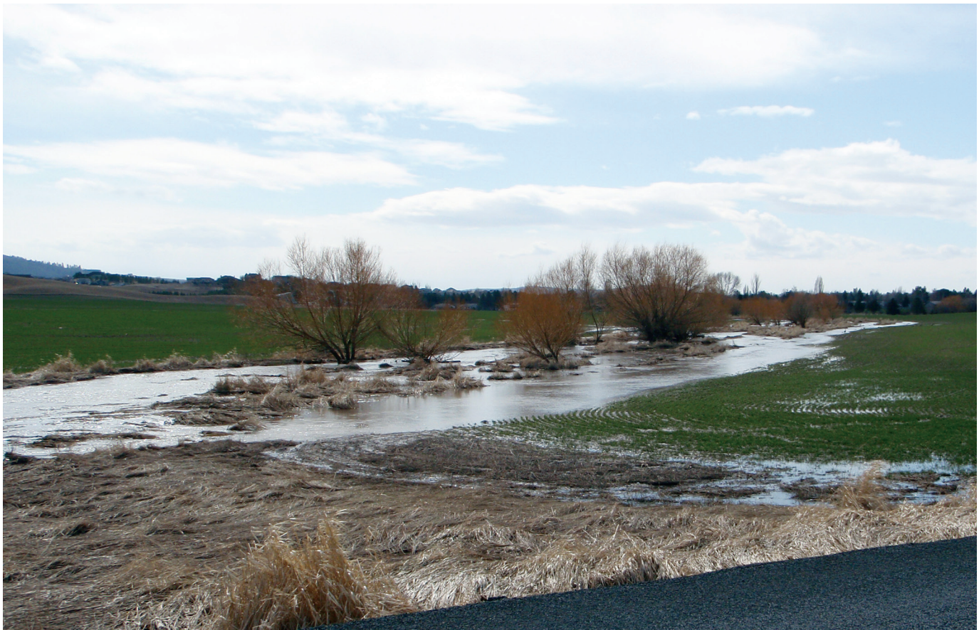
Flooding on Paradise Creek upstream of Moscow, ID, during the spring of 2012.

agricultural practices, such as building soil organic structure, fertilizing and irrigating at conservative levels, and diversifying crops and livestock, will be relatively successful as climate variability increases over the next several decades and beyond.